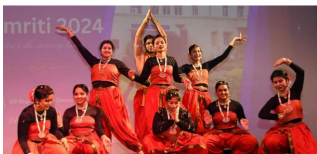
Welcome dance by existing students