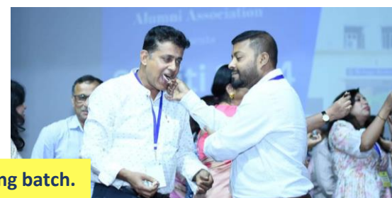
15 th year celebration for 5 th full-time batch and 1 st evening batch.